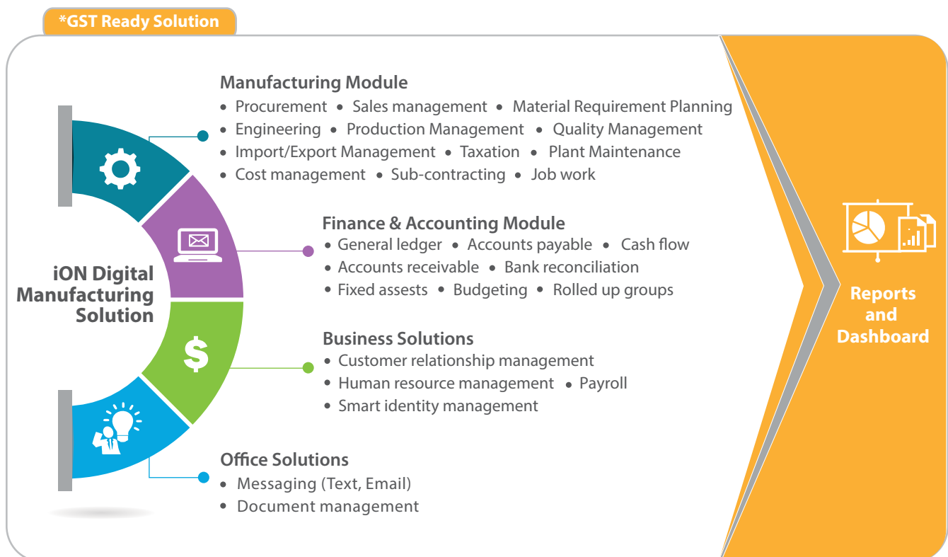
An Overview of iON Digital Manufacturing Solution

iON Digital Manufacturing solution integrates enterprise-wide functions to provide organizations a holistic view of geographically-spread business processes. The solution helps companies identify patterns in price and usage variances to help plan procurement and production capacities dynamically. It streamlines and optimizes procurement operations by automating purchase requisition, payment processing and enabling bulk procurement.